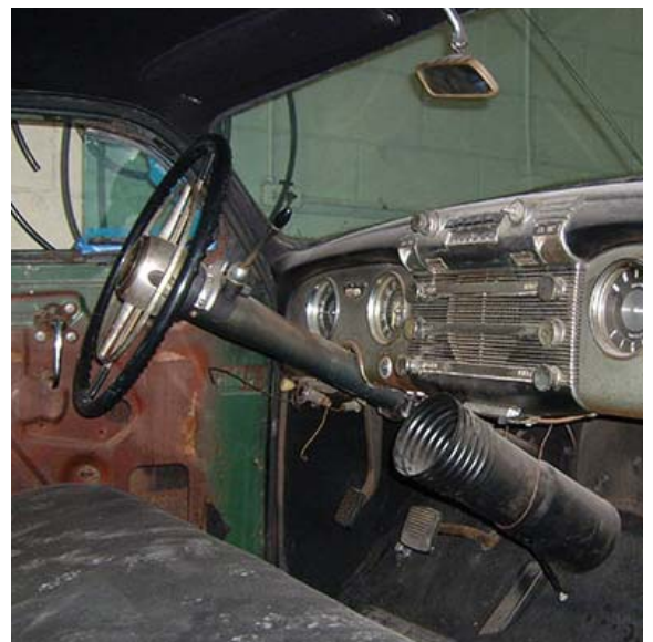
WAS THIS SALVAGEABLE? AN INTERIOR RENOVATION SPECIALIST FOUND OUT! (page 3)