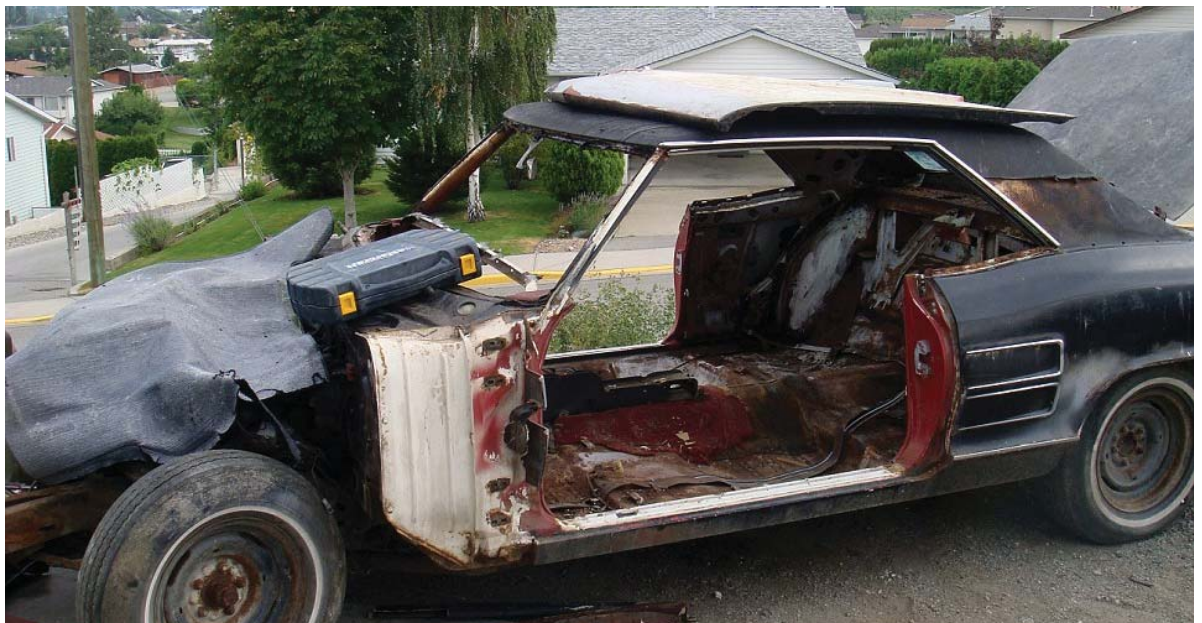
SEE WHAT BECAME OF THIS $400 CLUNKER, 22,000+ HOURS LATER (next page)

As many of you know, obtaining the perfect "project car" can be thrilling. But when it comes to repairs, renovations, and all of the manpower it's likely you'll encounter a few "wrenches" in the process. Below we've compiled a few before and after "treats" that may have felt more like a trick during the renovation process!