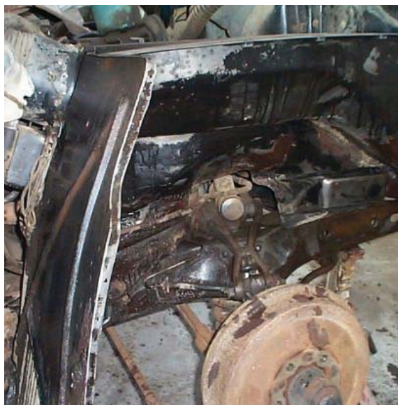
A REAL FIXER-UPPER (next page)