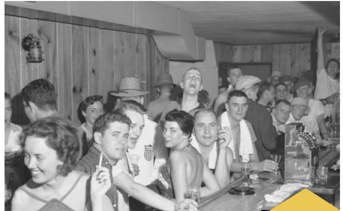
During the 1940s, wealthy Ivy Leaguers who traditionally partied in the Caribbean were scared off by rumours of German submarine activity. Many of them headed to Florida instead.

The actual historic origins of spring break actually lies with the Greeks. The ancients celebrated a spring festival called Anthestreria.