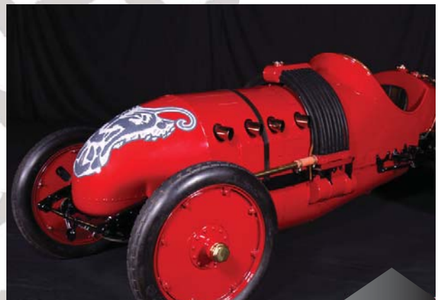
(above) The Buick Bug believed to have been driven by Bob Burman. The fate of Louis Chevrolet's Bug (top) is not known.

Sometime during 1911, Louis Chevrolet's Bug was lost. The whereabouts are still unknown. Burman's Bug was donated to the Sloan Museum in Flint,