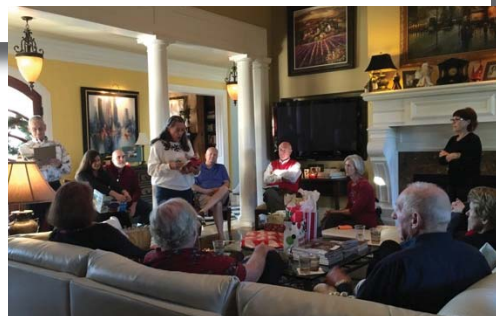
Music City Buick Club's 2015 Christmas Party