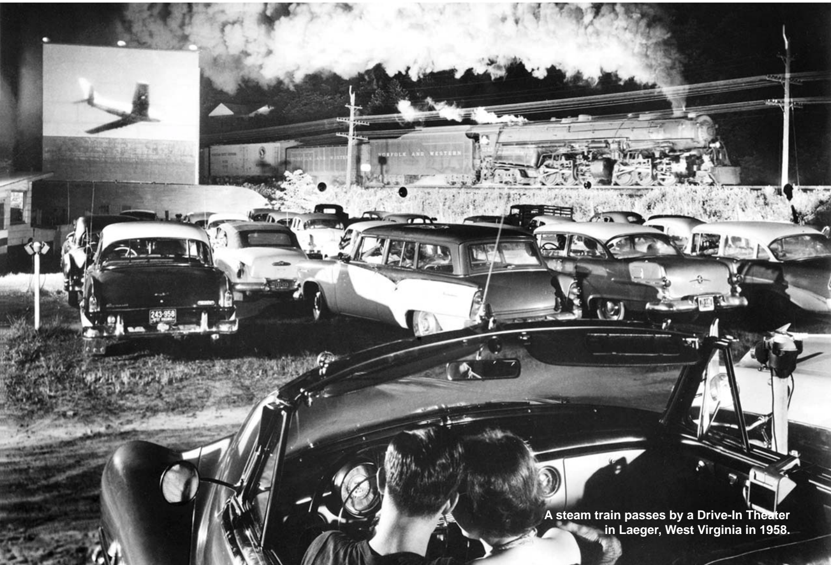
A steam train passes by a Drive-In Theater in Laeger, West Virginia in 1958.