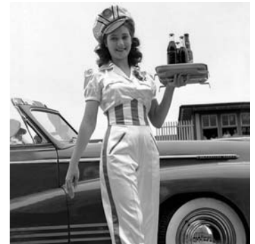
DRIVE IN SERVICE: Car hops pictured offer speakers & refreshments to movie-goers. (right) 1940s car hop in front of a Buick Special Convertible.