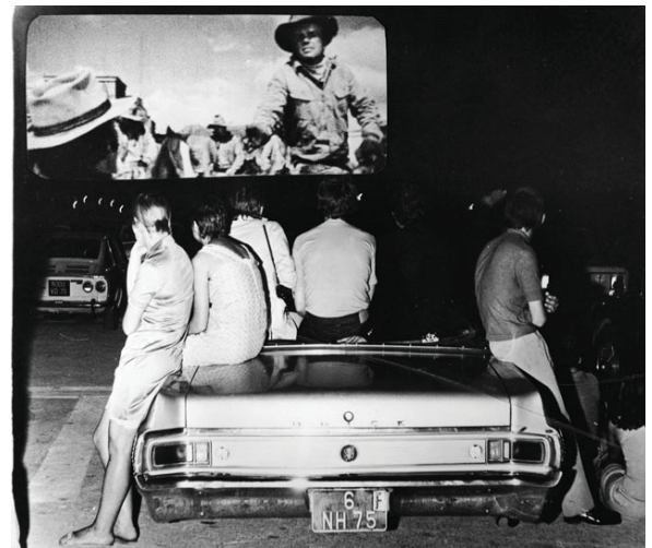
GOOD OLE FASHIONED FUN: (bottom) fa 1970s photo shows a Buick Convertible serving as seating for an unknown cowboy movie.