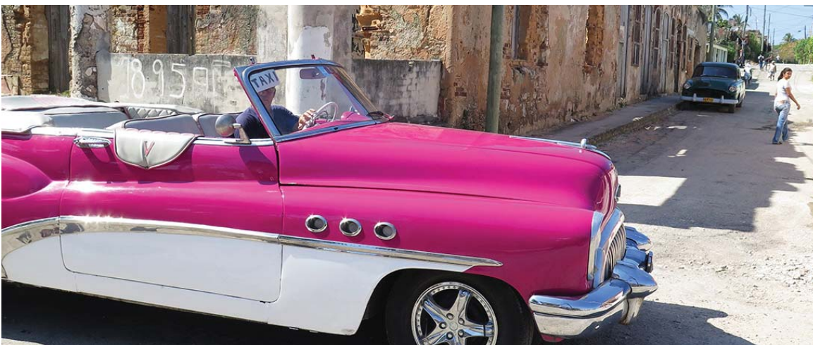
Many restored cars are used as taxis that target tourists in bigger cities such as Havana.

"The problem is that, in general, these cars... [have] been driven and used as daily cars," says Steve Linden, a vintage car appraiser. "The ability to keep these things running is what diminishes the value of the car because they're not original."